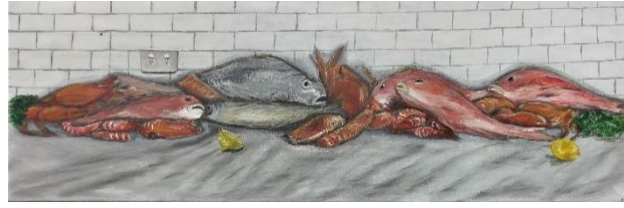
Overall winner: Belinda Bradshaw 'Seafood Platter'