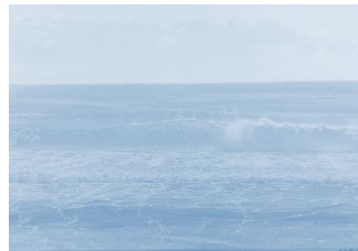
September Visitors' choice: Joy Kidson 'Morning Swell, Burleigh'