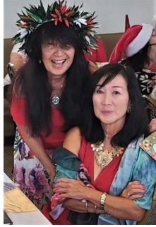
RQAS Christmas at Broadbeach Bowls Club