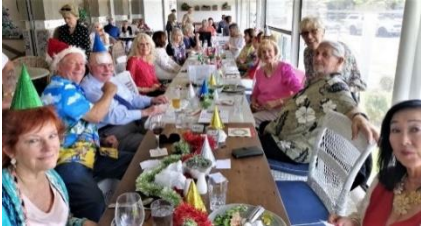
Cat Swingers farewell 2022