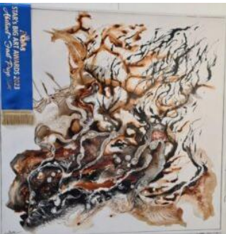
FIRST PLACE ABSTRACT VICKY WHITE 'BUSHFIRE'