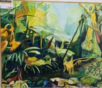
MUSGRAVE ART INNOVATION WINNER JACQUES MEUNIER 'NATURE SUPER VISION'