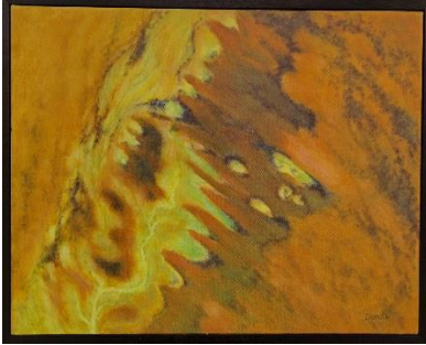
Theme winner: Petra Daecke 'The Divide'