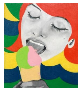
Evelyne Axell, 'Ice Cream' 1964

Evelyne Axell (1935 –1972) was a Belgian Pop painter who was mentored by surrealist artist René Magritte. Axell created her own style of Pop art, becoming one of the first Belgian artists to experiment within this avant-garde idiom. Although Belgian collectors were interested in her work, private galleries resisted showing her paintings. So Evelyne started to use the androgynous name "Axell" professionally, to be taken seriously as an artist. In 1969 she won the Young Belgian Painters Prize.