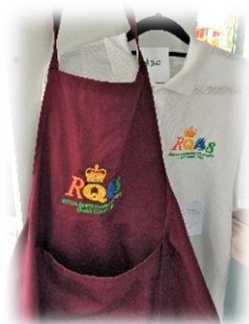
Aprons with RQAS emblem $30 ea